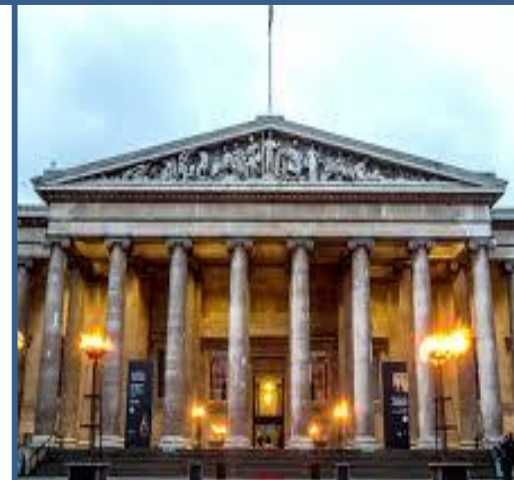
The British Museum